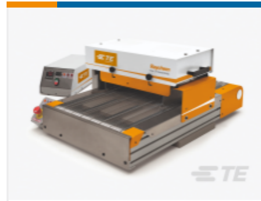
TE Part # 955018-000 CLTEQ-M105-TUNNEL-OVEN