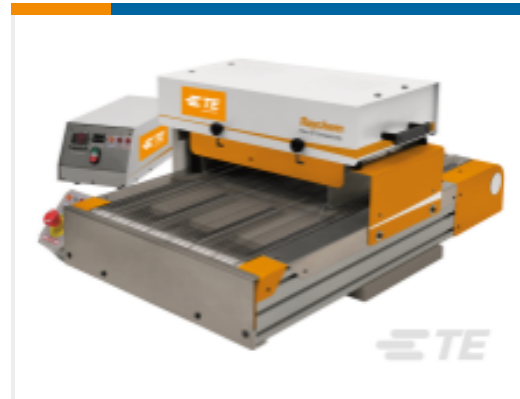
TE Part # 2394980-1 MOD 105 TUN OVEN, 69" ENTRY, STANDARD