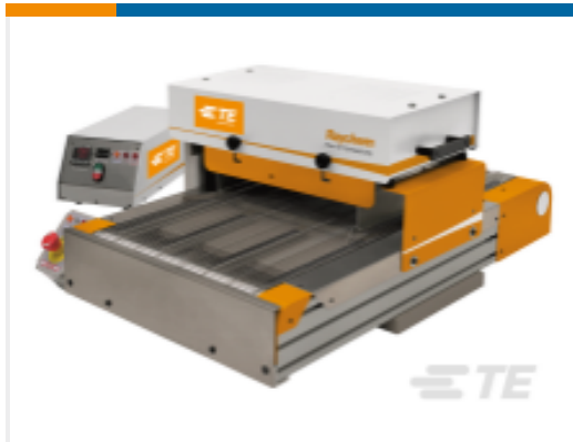
TE Part # 2326489-1 MODEL 105 TUNNEL OVEN, 36" ENTRY, STAND